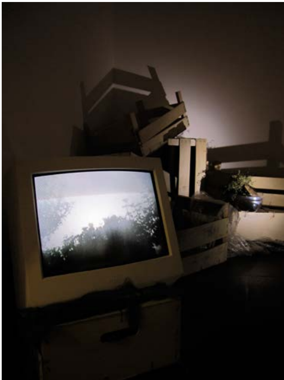
#EA00 2011 Video Installation Sala La Caixa, Tenerife 2011