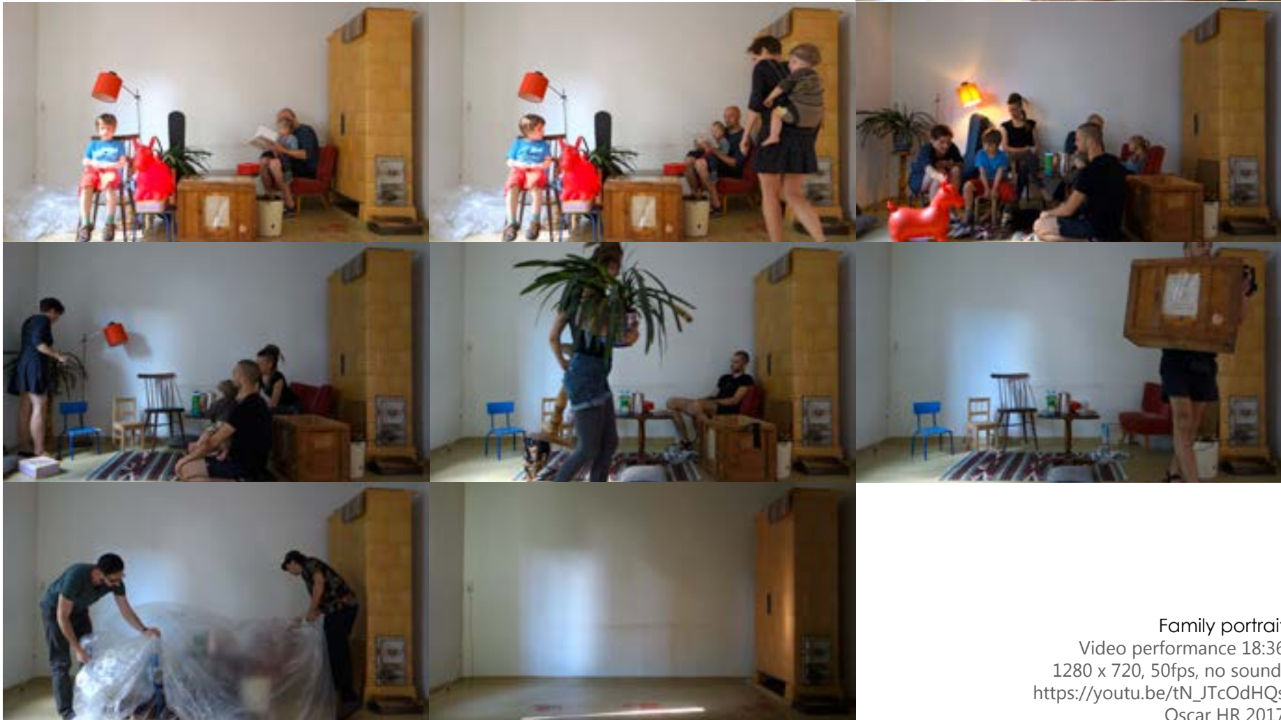
Family portrait Video performance 18:36 1280 x 720, 50fps, no sound. https://youtu.be/tN_JTcOdHQs Oscar HR 2017

I asked the neighbors to choose some objects and furniture and dispose of it for us. In one of the empty flats I set up the camera and I ask them to build a living room to make themselves comfortable. Then they should have to leave the room and take an object with them.