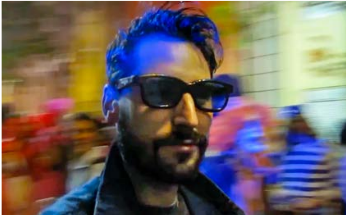
#SELFIE360 Carnaval, 2013 Video loop 2:10 YouTube: https://youtu.be/fJ6ylBgvZsY