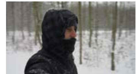
#SELFIE360 Autorretrato IV Tenerife, 2013 http://youtu.be/9xUbZeHdScU