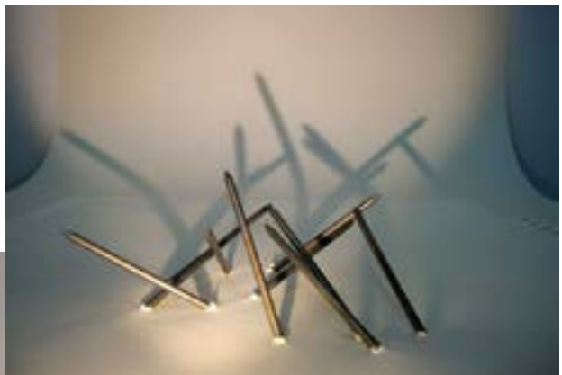
#EA10 2012 Installation. Shadow drawing, bulbs, boxes, fabric, objects and drawings. Sala La Granja, Tenerife 2012