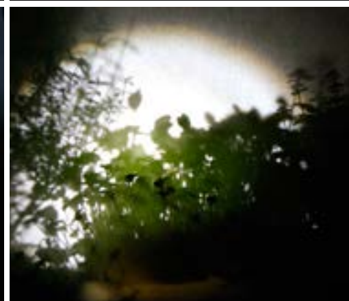
#EA0 2011 Video loop 16:36 https://youtu.be/NXfnn9dvRY4