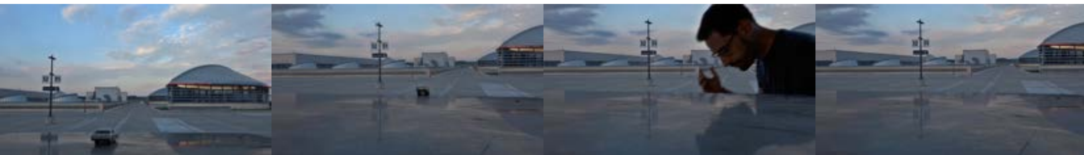
JUGANDO CON SUEÑOS N° 03 | '69 Chevelle SS 396 - Elbepark, Dresden | Digital Video, 1:00 - OscarHR 2016