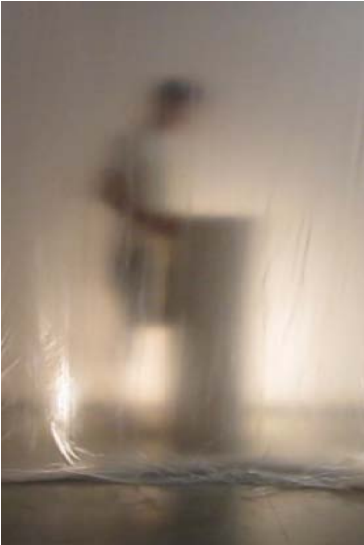
#SKYSCRAPERS 2011 Frame. Video loop 16:36 https://youtu.be/E-kSD7YiiOg