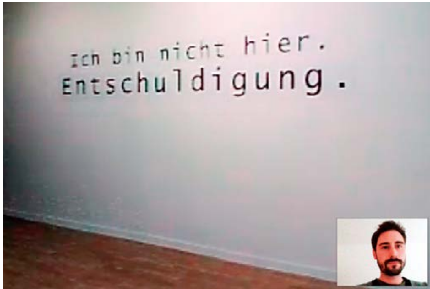
Ich bin nicht hier. Entschuldigung / I am not here. Excuse me Multimedia Installation. Google HangOuts connections with the visitors in the exhibition room during the project "Souvenir Identities" Mapfre Guanarteme Tenerife - HfbK Dresden Oscar HR 2015