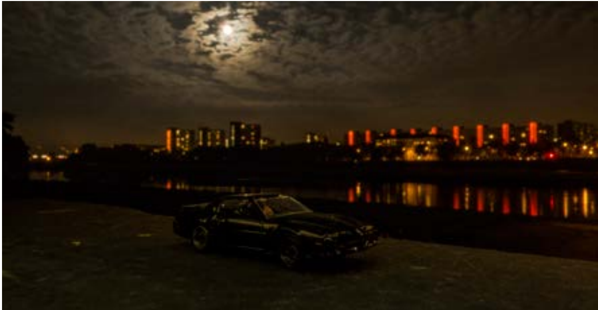
Pontiac Firebird. Dresden DEU, 2016. Digital Photography

“Playing with dreams is a photographic game on the road - started in 2011”