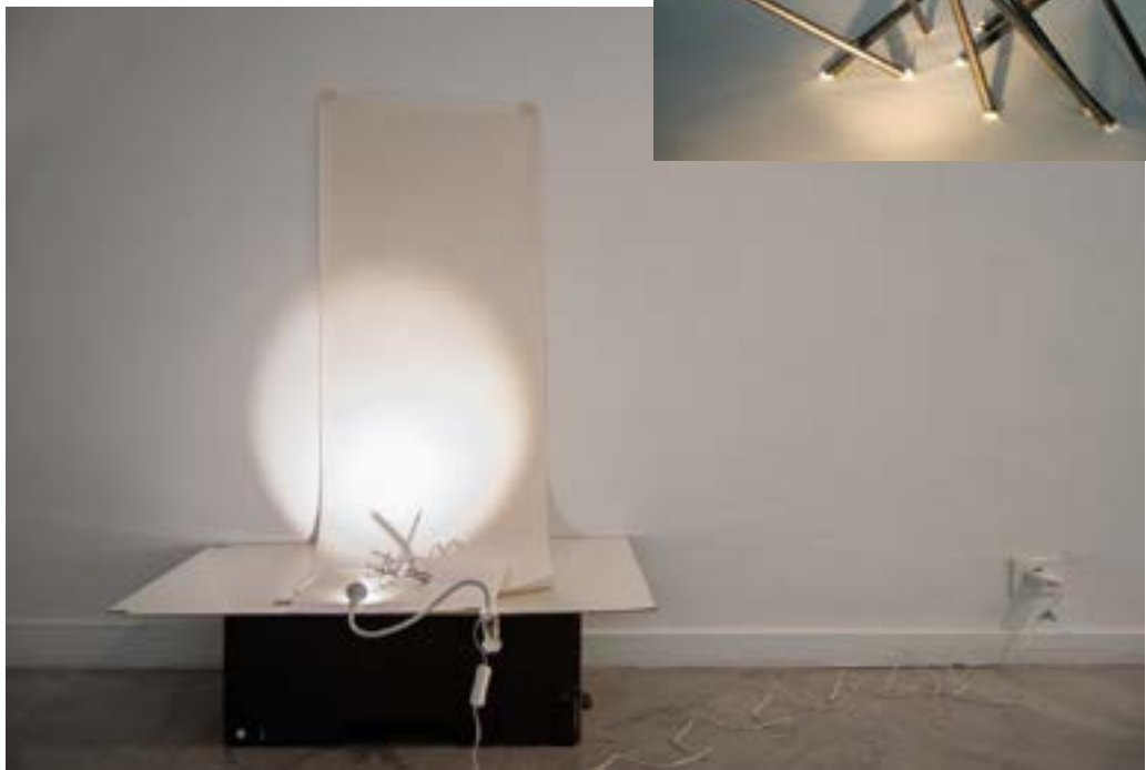
#EA11 2012 Installation. Shadow drawing with nails and paper. Sala La Granja, Tenerife 2012