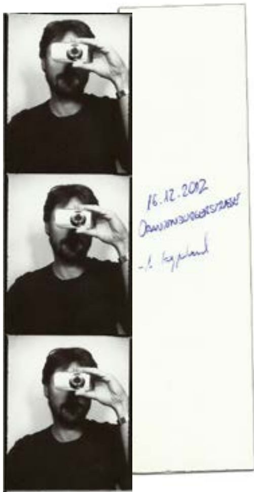
Selfportrait with my Digital Camera Photobooth in Berlin Analoge Fotografie 4 x 22 cm. Oscar HR 2012